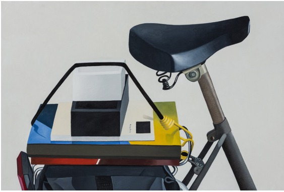
Nathalie Du Pasquier, Still life on my bicycle , 2005, oil on canvas, 39×59 inches.

artist to demonstrate the seamless boundaries between functional and decorative objects in Du Pasquier's practice. Across the space, still-life paintings depicting everyday objects and formal explorations will be installed against a backdrop of Du Pasquier's wallpaper designs, juxtaposed with the sculptures, textiles, and design objects that inspire her work in painting and illuminate her iterative process of creation.