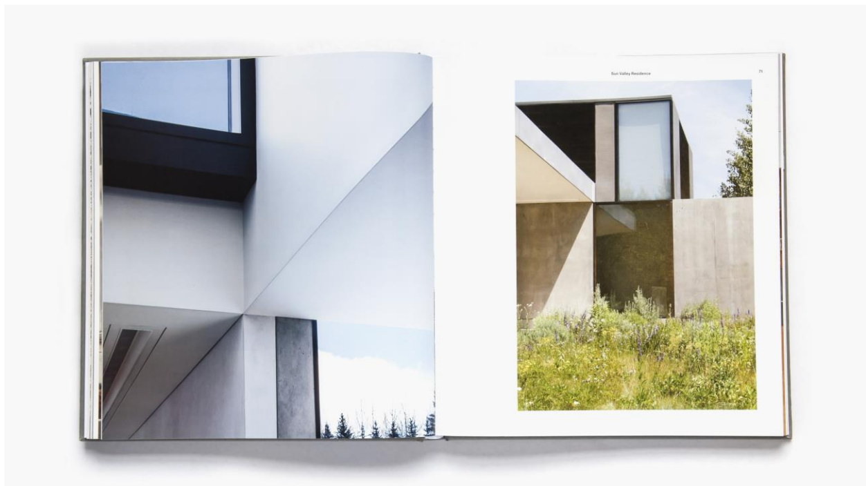
Details: Sun Valley Residence