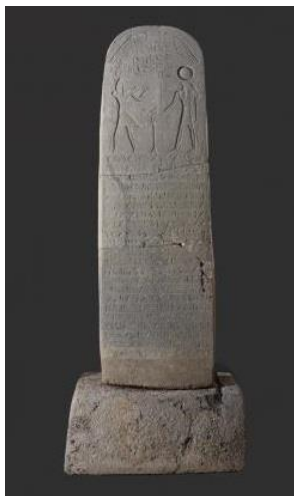
Victory stela of Seti I erected at Beth Shean, 13 th century BCE, Basalt