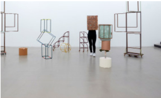
Jeong 1/4 Series , 2016, dimension variable, image from moving manual book for MMCA.

Additional highlights include sculptures that reflect the weight and tangibility of everyday objects; “hwamunseok,” traditional Korean mats handwoven with sedge reeds that grow on Ganghwa Island; and a special performance the weekend of the exhibition opening that will include a new “activation” directed by Kang featuring Seoul-based dancers. The tactile, sensory, and textured nature of Kang’s works, many of which incorporate repurposed materials sourced directly from factories in South Korea, will help form a physical connection between the objects and the viewer, creating a dynamic and interactive relationship to the surrounding space.