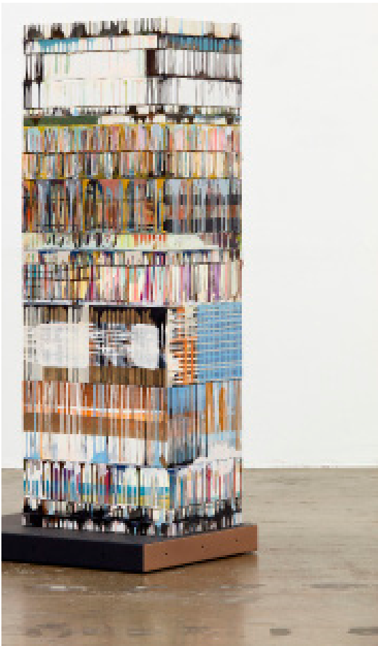
Mora with Black Mat, 2016, dimension variable, piled up paintings, painted steel, wheel.