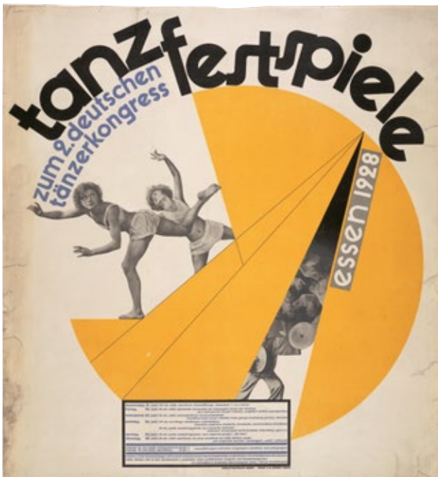
Max Burchartz. Tanzfestspiele zum 2. Deutschen tänzerkongress Essen 1928 (Dance Festival at the Second German Dance Congress) poster, 1928. Printed by F. W. Rohden, Essen. Photolithograph. The Museum of Modern Art, New York, Purchase Fund, Jan Tschichold Collection.

While writing the landmark book Die neue Typographie (1928), Tschichold, one of the movement’s leading designers and theorists, contacted many of the foremost practitioners of the New Typography throughout Europe and the Soviet Union and acquired a selection of their finest designs. A substantial portion of his collection, including work by El Lissitzky, Kurt Schwitters, László Moholy-Nagy, and Herbert Bayer, now in the collection of the Museum of Modern Art, will be displayed together for the first time.