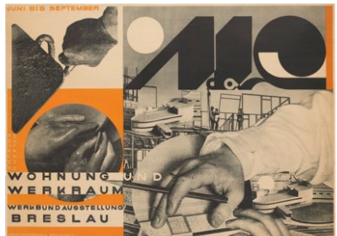
Johannes Molzahn. Wohnung und Werkraum (Dwelling and Workplace) poster, 1929. Printed by Druckerei Schenkalowsky, A.G., Breslau. Lithograph. The Museum of Modern Art, New York, Purchase Fund, Jan Tschichold Collection.

In celebration of its 25th Anniversary, Bard Graduate Center will present a series of exhibitions and events that showcase the institution's groundbreaking research and approach to the study of tangible 'things.' Beginning in fall 2018 and continuing through 2020, the 25th