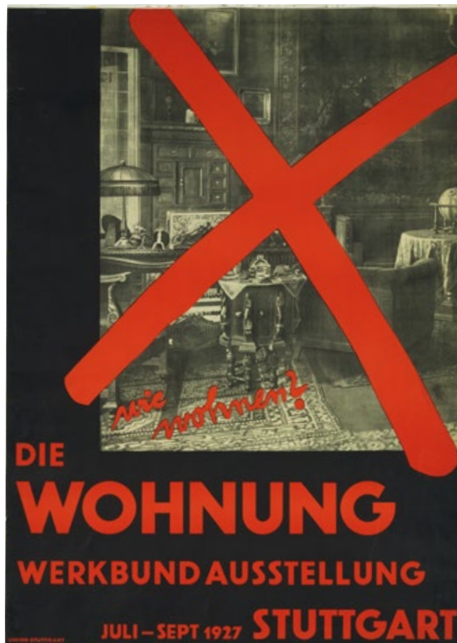
Willi Baumeister. Wie wohnen? Die Wohnung (How should we live? The Dwelling) poster, 1927. Deutscher Werkbund at the Weissenhofsiedlung, Stuttgart. Lithograph. The Museum of Modern Art, Gift of Philip Johnson.