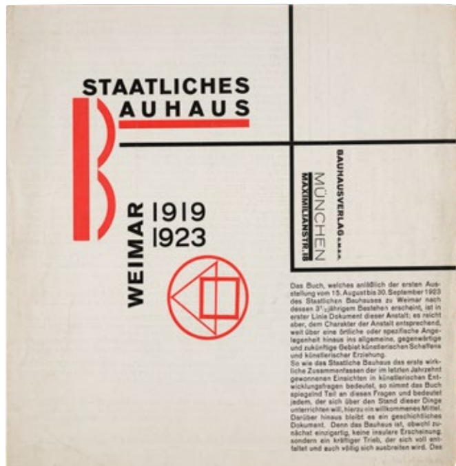
László Moholy-Nagy. Staatliches Bauhaus Weimar 1919-1923. Printed by Bauhaus Verlag, Weimar, 1923. Letterpress. The Museum of Modern Art, Jan Tschichold Collection, Gift of Philip Johnson.

“The Technological Age,” the final theme of the New Typography, will demonstrate how designers used innovative techniques to meet the requirements of