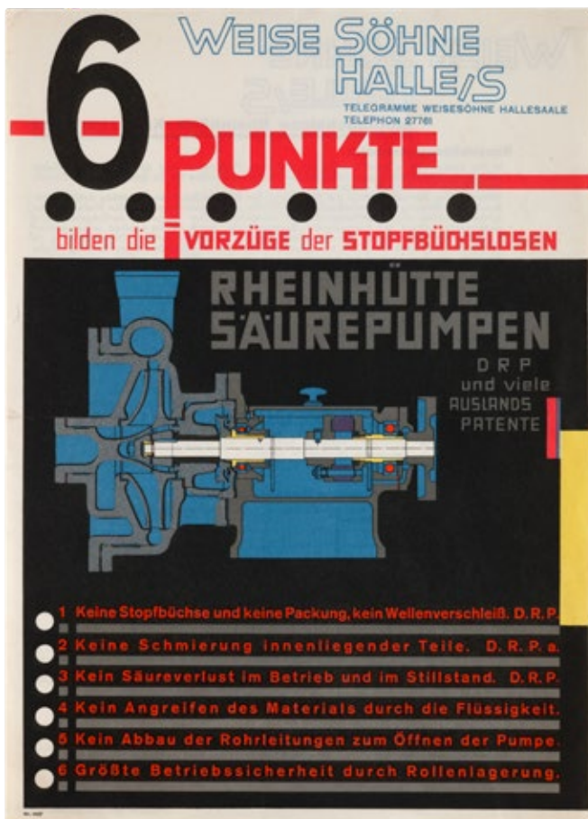
Kurt Schwitters. 6 Punkte bilden die Vorzüge der Stopfbüchsenlosen, Rheinhütte Säurepumpen, Weise Söhne, Halle/S (Six points create advantages for ... acid pumps, Weise Sons, Halle/Saale) brochure, ca. 1927. Letterpress. The Museum of Modern Art, New York, Jan Tschichold Collection, Gift of Philip Johnson. Digital Image © The Museum of Modern Art/Licensed by SCALA / Art Resource, NY. © 2018 Artist Rights Society (ARS), New York / VG Bild-Kunst, Bonn.

A fully illustrated book by Paul Stirton, published by Yale University Press, will be available in the Gallery and from the online store.