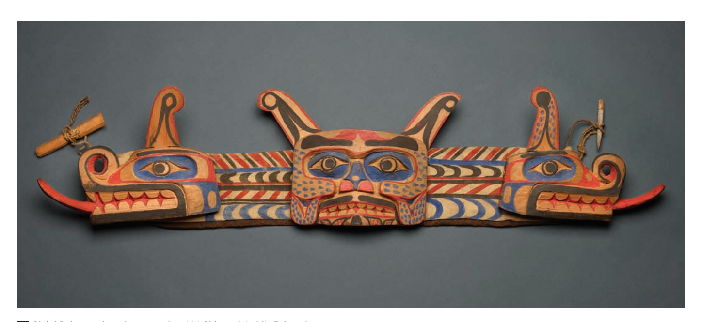
Sisiuł Belt worn by a dancer at the 1893 Chicago World's Fair, unknown Kwakwaka'wakw maker. Wood, cotton, paint, iron. © The Field Museum, Image No. A115416d_003, Cat. No. 18863, Photographer John Weinstein.

In celebration of its 25th Anniversary, Bard Graduate Center will present a series of exhibitions and events that showcase the institution's groundbreaking research and approach to the study of tangible 'things.' Beginning in fall 2018 and continuing through 2020, the 25th Anniversary celebration will include exhibitions on a diverse range of subjects, including Agents of Faith: Votive Objects in Time and Place, examining sacred objects and the practice of votive offering; French Fashion, Women, and the First World War; and Eileen Gray: Creating a Total Work of Art, an in-depth examination of the work and contributions of the iconic modernist designer and architect, presented in collaboration with the Centre Pompidou, Paris. Other initiatives during the anniversary years will also advance research and scholarship, recognize leaders in the field, present engaging programs for the public, and foster a new generation of students and scholars. bgc.bard.edu.