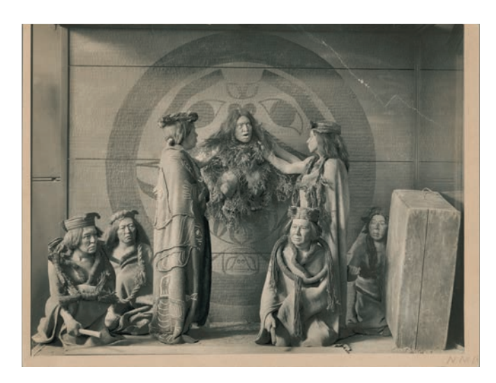
Hamat'sa diorama, source for plate 29, showing the life group Franz Boas produced for the U.S. National Museum, ca. 1895. Photograph. Neg. 9539.