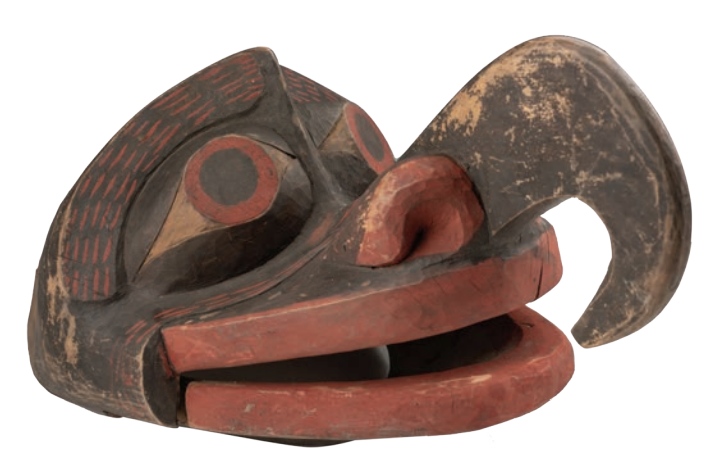
Mask, unknown Nuxalk or Heiltsuk maker. Wood.

A culmination of anthropologist Franz Boas's (1858–1942) first decade of fieldwork among the Kwakwaka'wakw of British Columbia, The Social Organization was one of the first holistic portraits of a Native North American society. It was also the result of a deep collaboration with his Indigenous research partner, George Hunt, who was credited on the title page. Commissioned by the United States National Museum as a catalogue of its own collection, Boas and Hunt expanded the text to include hundreds of ceremonial