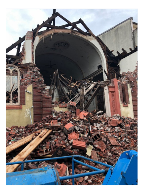
in Philadelphia at Christian Street and 11th Street, Summer 2018.