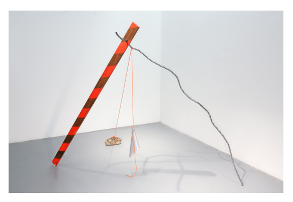
Michelle Lopez, Barricade , 2018, walnut, paint, steel, reflective fabric, paracord and rubble, 57\times80\ 1/2\times62 inches.

Known for creating sculptural works that subvert histories of minimalism through a feminist lens and deconstruct symbols of nationalism, power, and identity through a process of formal reduction, alchemy, and violence, Lopez transforms the ICA gallery into a meditation on our fraught political moment through Ballast & Barricades . Blockades, borders, flags, and natural elements meticulously crafted by hand bleed together as distinct yet interconnected symbols within the space. Fragments of construction sites, scaffolding, large boulders, and architectural structures are positioned within the wider work to create a delicate system of counterweights and counterbalances, permeating the immersive installation with a sense of precariousness. The aggressive sound of a flag and its rope hitting a flagpole from the artist's earlier work Halyard (2014) enhances the sensory nature of the experience and heightens the sense of disorder presented through sculptural means.