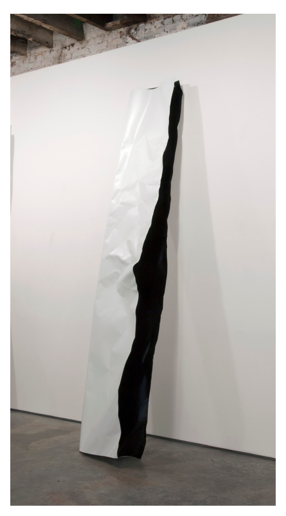
Michelle Lopez, Blue Angel , 2011, aluminum and powder-coated aluminum, 120 \times 24 \times 12 inches. Courtesy of the artist and Simon Preston, New York.