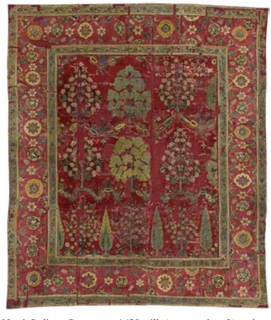
North Indian, Carpet, ca. 1630, silk (warp and weft) and pashmina (pile), The Frick Collection, New York

The installation will focus renewed attention on less familiar areas of the collection, including two seventeenth-century Mughal carpets, one of which is an especially rare and remarkable example. Removed from the mansion's domestic setting and thereby freed of the reminder of their practical function, these carpets will be hung on the walls like paintings, a display in keeping with their status as works of art of the highest quality. In the same manner, the installation will feature display areas and rooms dedicated by medium to significant works of French furniture, Asian and European porcelain, Renaissance bronze figures, portrait medals, French enamels and important European clocks. This mode of presentation will offer fresh insights on the breadth of decorative arts acquired by Henry Clay