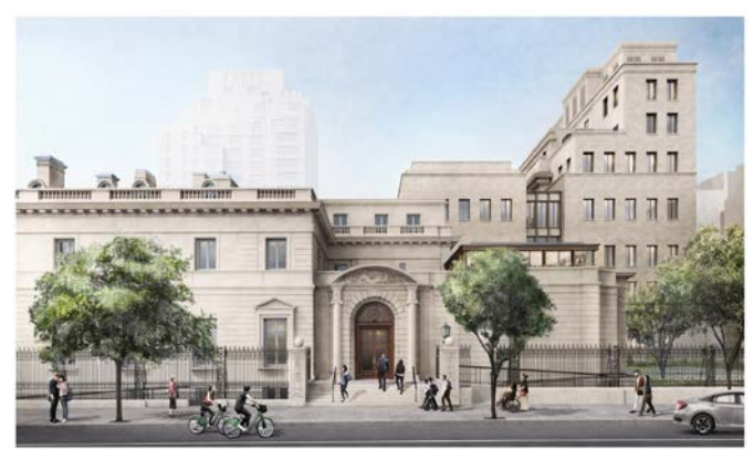
Rendering of The Frick Collection from East 70th Street

Honoring the architectural legacy and unique character of The Frick Collection, the plan designed by Selldorf Architects will provide unprecedented access to the original 1914 home of Henry Clay Frick, while preserving the intimate visitor experience and beloved galleries for which the Frick is known. Conceived to address pressing institutional and programmatic needs, the plan will create critical new spaces for permanent collection display and special exhibitions, conservation, education, and public