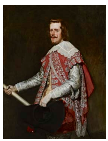
Diego Rodríguez de Silva y Velázquez, King Philip IV of Spain , 1644, oil on canvas, The Frick Collection, New York

The Frick Madison installation will be presented across three floors of the Breuer building, with paintings, sculptures, and decorative arts organized by time period, geographic region, and media. Highlighting strengths in particular schools and genres, the display will present the collection in galleries dedicated to Northern European, Italian, Spanish, British, and French art, setting the stage for rooms dedicated exclusively to works by individual artists, including