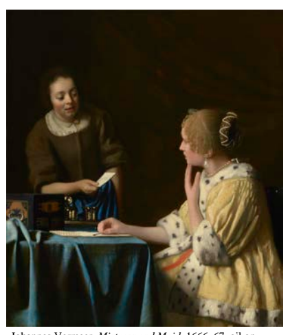
Johannes Vermeer, Mistress and Maid , 1666–67, oil on canvas. The Frick Collection. New York