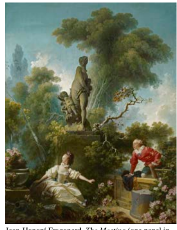
Jean-Honoré Fragonard, The Meeting (one panel in the series called The Progress of Love), 1771–72, oil on canvas, The Frick Collection, New York

At Frick Madison all fourteen paintings of Fragonard's Progress of Love series will be displayed together for the first time in the Frick's history, including three panels that have been in storage much of the time since Mr. Frick purchased the set for his home in 1915. The series will be displayed to reflect its history, as it was created during two distinct campaigns, twenty years apart. The initial four canvases (1771–72) will be shown in a gallery adjacent to a room that displays the later ten canvases (ca. 1790–91), a temporary arrangement that has never been possible in the Frick mansion.