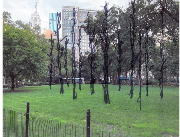
Preparatory sketches for Ghost Forest , 2019, by Maya Lin. Collection Maya Lin, courtesy Pace Gallery.

New York, NY | Updated February 9, 2021—For Madison Square Park Conservancy's next public art commission, Maya Lin will realize a site-responsive installation that brings into focus the ravages of climate change on woodlands around the world. Ghost Forest will take the form of a towering grove of spectral cedar trees, all sourced from the region and presented in sharp contrast to the Park's lush tree line. The installation builds on Lin's practice of addressing species loss, habitat loss, and climate change within her work and serves as a call to action to the thousands of visitors who pass through the Park daily. Originally planned for summer 2020, the exhibition will now open on May 10, 2021, and remain on view through November 14, 2021.