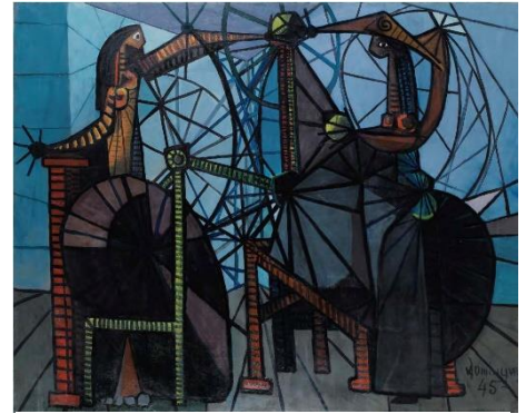
Oscar Dominguez, Les Deux Voyantes , 1945.

Within the exhibition's presentation of modern and contemporary pieces is a masterwork by Spanish Surrealist Oscar Dominguez, Les Deux Voyantes (1945). The painting depicts two clairvoyants examining a crystal ball against a webbed background of intense blue, seemingly oblivious to the viewer. The polygonal webbing collapses the space between the figures, themselves composed of geometric shapes, and the patchwork of dramatic blue backdrop, creating a juxtaposition and illogicality characteristic of post-war Surrealism.