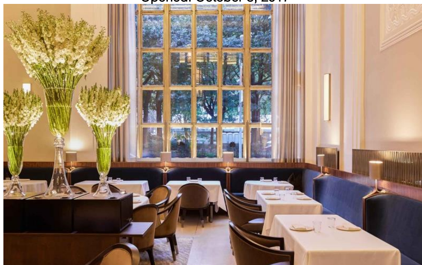
The Redesigned Eleven Madison Park by Allied Works.

Allied Works Architecture's design for the renovation and redesign of Eleven Madison Park encompasses the entire dining space of the acclaimed restaurant—heralded as the World's Best—from the interior architecture of the main dining room and bar to the furniture, tableware, and textiles. The project honors and enhances the original Art Deco design of the space, which originally served as the lobby to the landmark Metropolitan Life skyscraper in Manhattan's Flatiron District, facing Madison Park. Working in close collaboration with restaurant co-owners chef Daniel Humm and restaurateur Will Guidara, Allied Works honed a new vision for the space, designed to celebrate and elevate the ritual of dining at every level. The renovation preserves many of the dining room's defining features, amplifying original detail and colors, and includes new bespoke designs, from the tabletop and chairs to hand-tufted rugs and diving screens, all created by Allied Works for the space.