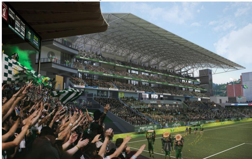
Rendering of proposed Providence Park stadium expansion from the historic grandstand © Allied Works Architecture