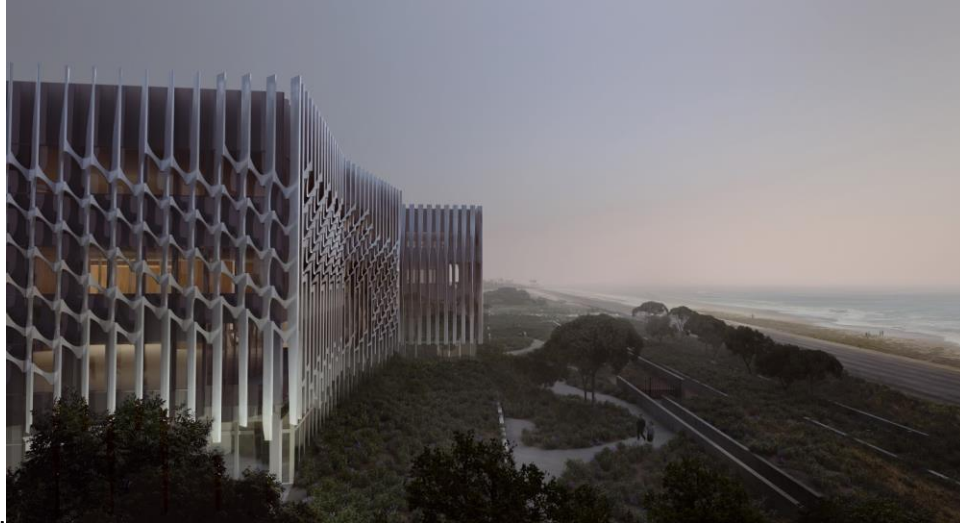
Exterior rendering of the new United States Embassy, Mozambique. Image © Mir

Situated adjacent to the Indian Ocean in the capital city of Maputo, the new United States Embassy in Mozambique spreads across 10 acres and includes nine buildings for working, living, and representational events. The design balances the twinned goals of security and transparency. Site-cast concrete defines the exterior walls of the buildings, while an undulating brise-soleil façade allows in light, air, and views of the surrounding landscape, which transitions from beachfront to forested hills. Covered walkways will facilitate easy movement between different campus locations, including its main chancery building, Marine Security Guard residence, Embassy community facilities, and service buildings—all of which have been carefully arranged to create interior gardens and lawns.