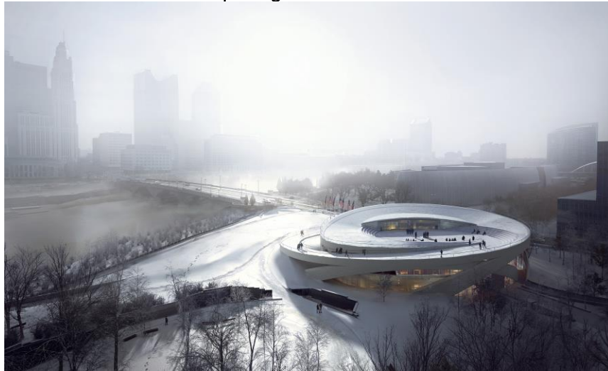
Exterior rendering of the Ohio Veterans Memorial and Museum. Image © Mir

Located on the banks of the Scioto River across from downtown Columbus, the National Veterans Memorial and Museum embraces ideas of service, duty, and remembrance through a fluid architectural design that unites the building with its surroundings. The 55,000-square-foot building, exterior plaza, and its surrounding seven acres of landscaped grounds will become a gathering space for a range of exhibitions as well as commemorative and civic events. The exhibition design, created by Ralph Appelbaum Associates, will lead visitors through a narrative journey exploring core themes and stories related to the veteran experience. Emphasis will be placed on connecting military service to the broader idea of public and community service, fostering a connective dialogue between civilians and veterans. A set of “thematic alcoves” evoking the emotions and challenges of America’s servicemen and -women will serve as the display framework, alongside a dimensional “timeline” detailing the major events and important individuals who have shaped the country’s military history. Moreover, the exhibition is