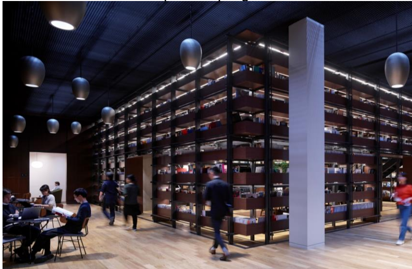
Exterior view of Uniqlo City's reading room.

The first progressive workspace of its kind in Japan, Uniqlo City is the groundbreaking new headquarters and flagship creative studio for Fast Retailing, one of the world's leading apparel companies. The 200,000-square-foot project—spanning more than four acres of continuous interior space—was planned as a “city” of dynamic and interlaced neighborhoods, with flexible work lofts and communal spaces including libraries, plazas, lounges, and digital information hubs. Uniqlo City fosters collaboration and exchange among employees and supports a dynamic interplay between product development, operations, and distribution around the globe. The design sets a new standard for an international headquarters working across cultures and has served as a creative catalyst for the brand, inspiring new ways of working for Fast Retailing's staff of over 1,000 employees. Located in the Ariake District, on the shore of Tokyo Bay, Uniqlo City is AWA's first project in Asia, and follows the firm's commission in 2013 to create Fast Retailing's creative studio and fabrication facility in New York for the brand's subsidiary labels Theory and Helmut Lang.